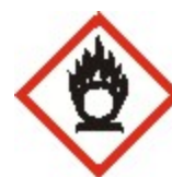
Flame over Circle